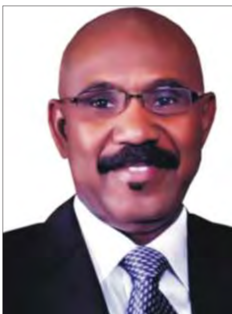
- Adeleke Mamora