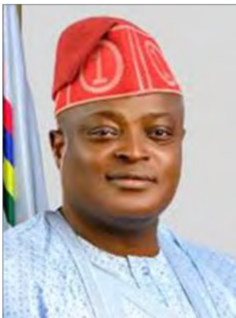
- Mudashiru Obasa